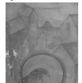
Detail from what remains of the paintings today