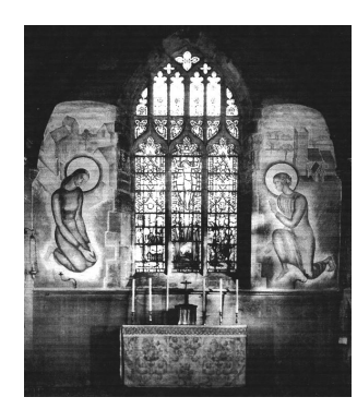
View of the east wall c. late 1940s

develop plans to restore the Gibbs murals, the barrel vault ceiling and the east window as part of the Hidden Treasures project. Other work includes installing under floor heating, new stone floor tiles and new lighting. There will be three years of heritage activities for all ages, including arts, crafts, wildlife workshops, as well as volunteering opportunities. If successful the project will begin in early 2014 with the aim of not just revealing the hidden heritage but also the skills and talents within each of us. Contact us at www.stmartinsbilborough. org.uk